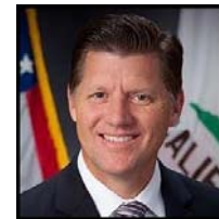
State Senator Brian Jones

(For more information, visit the 'Speakers' page on TERC's website: www.escondidorepublicanclub.com .)