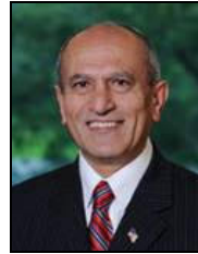
Escondido Mayor Sam Abed